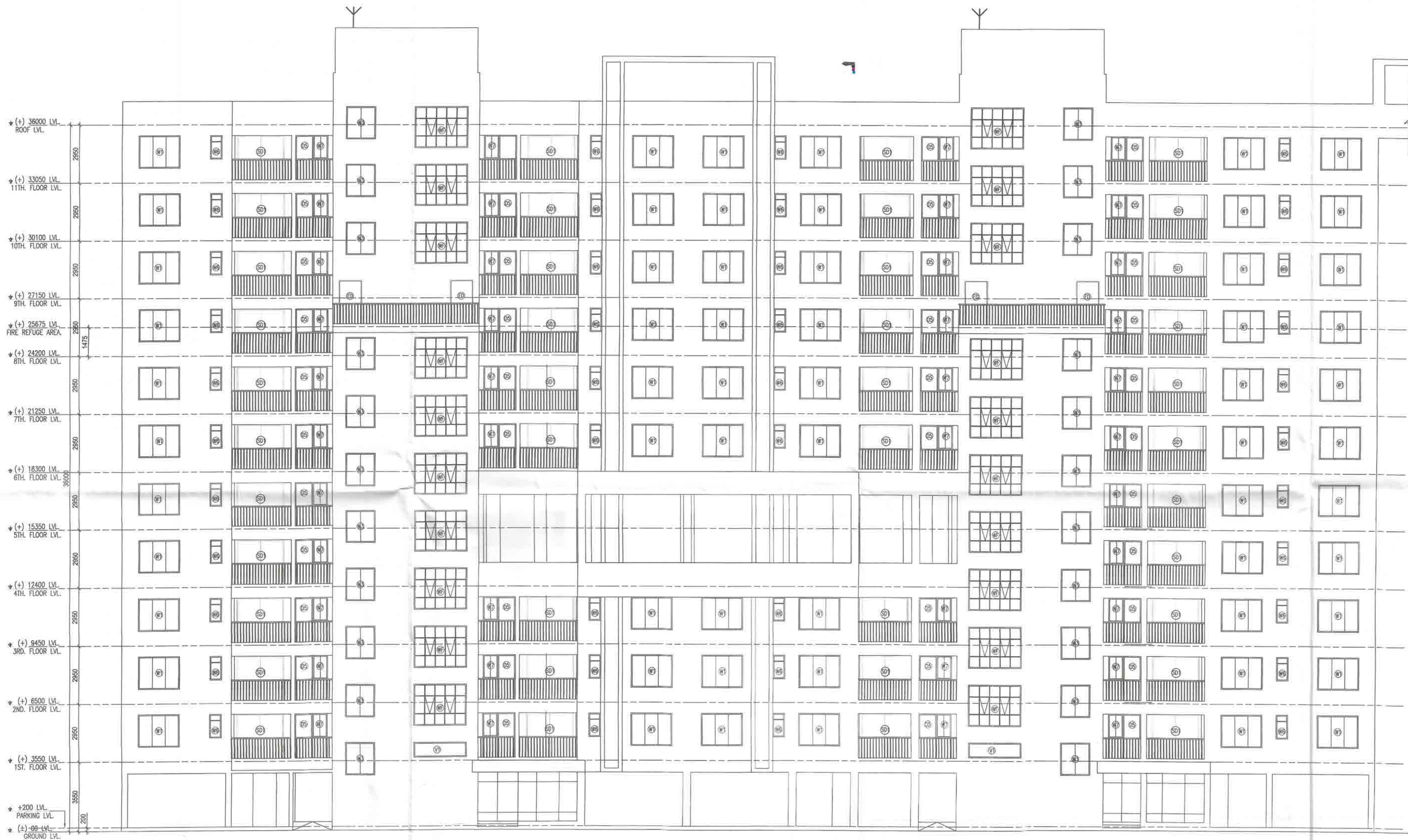
FRONT ELEVATION SCALE : 1:100